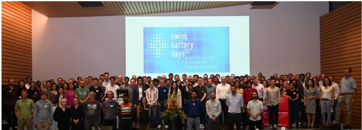
Picture 1: Group picture with all participants of the Swiss Battery Days 2022 at Empa Academy in Dübendorf.

80 scientific abstracts were received by the abstract submission deadline on July 1 st including about 50% of abstracts from Swiss research institutions (Empa (16), PSI (8), ETH (6), CSEM (3), BFH (1), EPFL (1), UniFr (1)), Swiss companies (4), and also an increasing number of abstracts, about 50%, from research institutions and companies outside of Switzerland (40) (see abstract books for details).