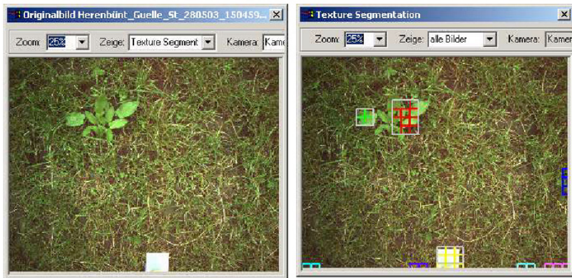
Figure 2. Screenshot from the Qualireader detection software. On the left, the original image; on the right, the homogeneous image regions detected that will then be classed as “rumex plant” or “background” by the classifier.

A detection accuracy of 87 to 97 % was obtained in 5 datasets with 941 images and 563 manually verified rumex plants. The proportion of objects wrongly classified as rumex to effective rumex was between 6 and 35 %. The detection accuracy depends very much on the surrounding vegetation. In meadows with a high proportion of weeds, detection accuracy declines and the erroneous detection rate rises. Figure 2 shows an original image and the homogeneous regions detected by the algorithm. The homogeneous regions are then processed by the classifier and divided into “rumex plant” and “background”.