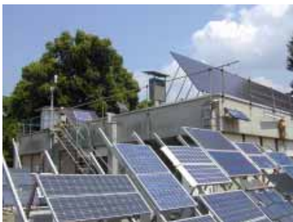
Fig. 3: Test stand for module tests at LEEE TISO

Preparations are in hand for certification of the laboratory. During the report period, long-term measurements on the three in-house installations were continued. In the new MTBF-PV [18] project, the long-term analyses carried out by TISO on the oldest grid-coupled photovoltaics installation in Europe (10 kWp, 1982) will be expanded in collaboration with the European test laboratory at Ispra. It was discovered that a large proportion of the modules displayed discoloration of the encapsulation compound and delamination. Nevertheless, both the modules and the installation gave good production performance. In order to obtain statistically relevant results it is intended to perform comprehensive measurements on all 273 modules.