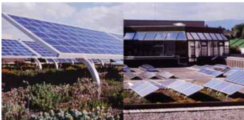
Fig. 2: Green roof photovoltaics installation with Solgreen at EPF Lausanne

In the DEMOSITE [15] project, numerous variations on the theme of building integration of photovoltaics in flat roofs, gable roofs and façades may be seen in juxtaposition. The project forms part of the international IEA PVPS Task 7 program. The opportunities it offers for practical comparison have already enabled several products and systems to be conceived or improved in the course of projects. Three new stands were set up during the report period, namely SOLGREEN® (Fig. 2), COLT and PIL-SIM. The project may be visited virtually in Internet ( www.demosite.ch ), where detailed information may be obtained. It is also intended to provide a course of further education on the building integration of photovoltaics on the Internet. The final report summarises the work up to and including 1999 [37].