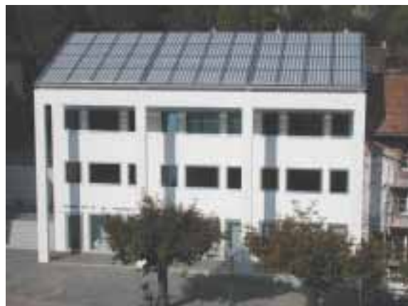
Fig. 9: PV roofs in the old town of Unterseen