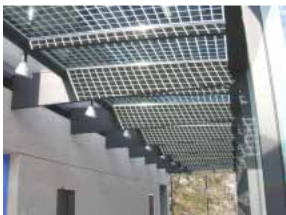
Fig. 8: Insulating glass modules at Stadelhofen Cantonal School, Photo: NET Ltd.

In other sectors, a useful yield increase has been achieved for modules with specially coated glasses [73], and improved quality assurance measures [76] have been implemented.