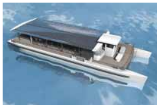
Fig. 7: Illustration of the solar ferry (© Dransfeld, dyne design engineering gmbh)