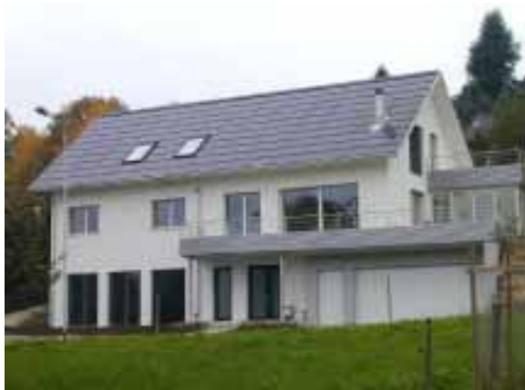
Fig. 4: Roof integration with SOLRIF