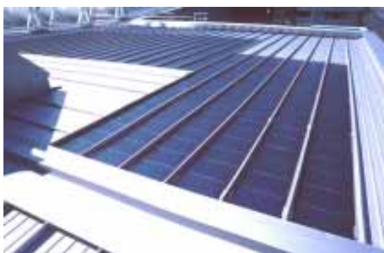
Fig. 6: Thermally insulated PV jointed metal roof

In 2000, 10 new projects were begun in the PV P+D program. The emphasis remained on the installations sector, where half the projects were situated. In the building integration sector, the thermally insulated jointed metal roof comprising amorphous triple cells [55] (Fig. 6) is certainly of particular interest. The experience gained was directly exploited in further developing the system. First-time application to an installation of the latest generation is planned for spring/summer 2001. Following the positive results obtained in the laboratory and from tests on 3 power inverters based on LonWorks as communication platform [44] (Phase 1, Fig. 5), a 250 kWp pilot project involving 68 power inverters of this type was commissioned in February 2001 (Phase 2). It is interesting to note that power inverters on LON communication platforms were explicitly mentioned as one of the highlights of the exhibition in the final summary of the 15 th PV Symposium 2000 in Staffelstein. In summer 2001, test runs will begin on a passenger ferry carrying 200 persons (Fig. 7), whose motive power will come from a 20 kWp photovoltaics installation on the cabin roof (autonomous installation) [66].