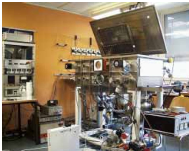
Fig. 1: Roll-to-roll reactor at VHF Technologies

A new KTI start-up project on the continuous (roll-to-roll) fabrication process [4] for producing amorphous solar cells on plastics substrates is being pursued at Le Locle College of Technology in collaboration with VHF Technologies. By in situ deposition of all required films on a 30 m long and 30 cm wide polyimide substrate, it is aimed to achieve a deposition capacity of 2,000 \text{ m}^2/\text{a} at an efficiency of 3%. During the report period, the reactor (Fig. 1) was brought into operation, enabling the various films with the required properties to be deposited. The process will first be used for the manufacture of small electronics products.