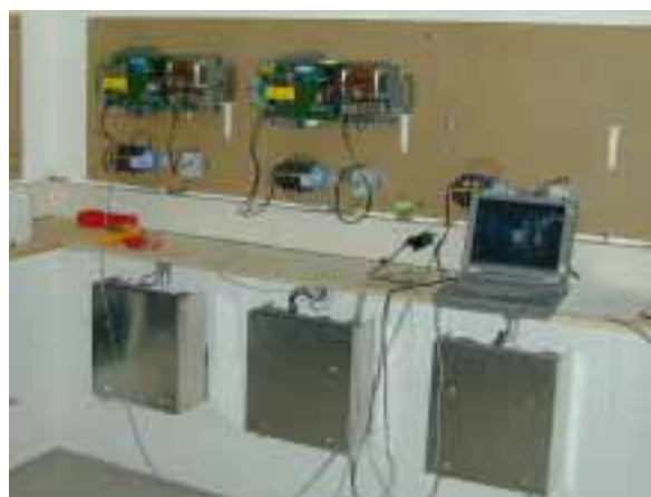
Fig. 5: Inverter prototype with LON nodes