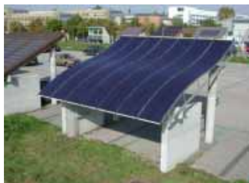
Fig. 4: Freestyle photovoltaic roof (Demosite), (source: LESO / EPFL)

Enecolo continued its work on the EU ENERBUILD [19] project, which involved a 'thematic network' on energy in buildings ( www.enerbuild.net ) to list R+D activities and strengthen cooperation in the field. In this project, Enecolo is responsible for the photovoltaic in buildings basket. During the report period, information on current work on building integration of photovoltaics in Europe was gathered, enabling preliminary proposals for future strategies and the need for action to be assessed.