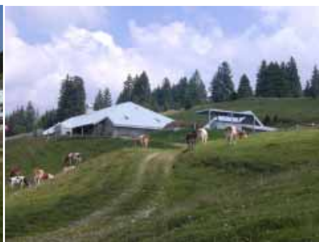
view from below

Photovoltaïc roofing over the batteries-van, on the left of the farm.