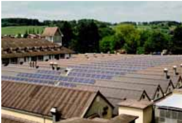
Fig. 18: Felsenau installation with LON monitoring