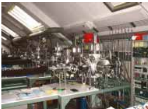
Fig. 1: Plasma reactors at IMT