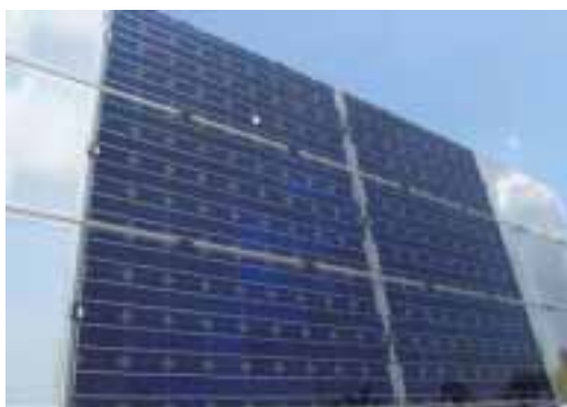
Fig. 3: Solface photovoltaic facade (Demosite)

In the DEMOSITE [18] project, numerous variations on the theme of building integration of photovoltaics in flat roofs, gable roofs and facades may be seen in juxtaposition. The project forms part of the international IEA PVPS Task 7 programme. The opportunities it offers for practical comparison have already enabled several products and systems to be developed or improved in the course of projects. Four new stands were set up during the report period, namely Solgreen II, Solface (Fig. 3), Freestyle (Fig. 4) and Kawneer. The project may be visited in Internet ( www.demosite.ch ), where detailed information is given. It is also intended to provide an Internet course of further education on building integration in photovoltaics.