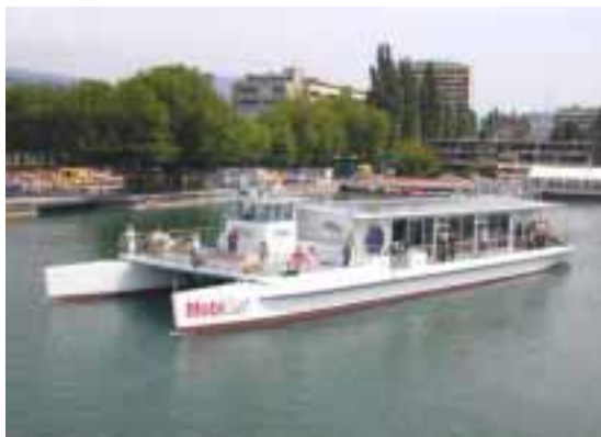
Fig. 14: Inauguration of Mobicat

For grid-coupled installations, measurements on the PV Eurodach amorphous installation demonstrated the expected low temperature dependency of the voltage, and thus also of the energy yield [49], Fig. 15.