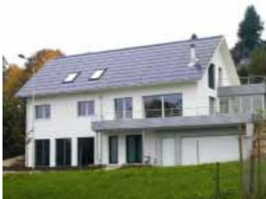
Fig 7: Full-area roof integration of SOLRIF