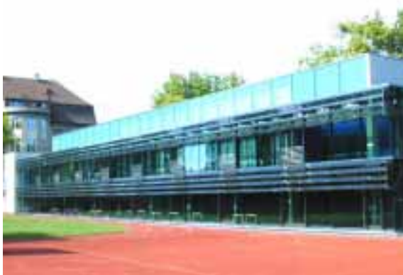
Fig. 22: Stadelhofen cantonal school, Zurich