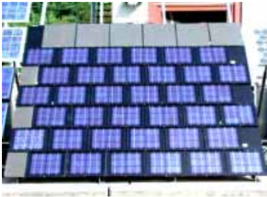
Fig. 20: Test stand with Sunplicity roof slates