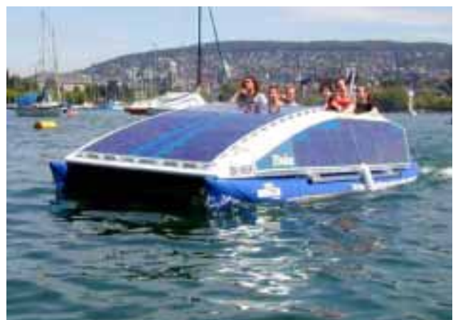
Fig. 13: Solar boat for hire on Lake Zurich