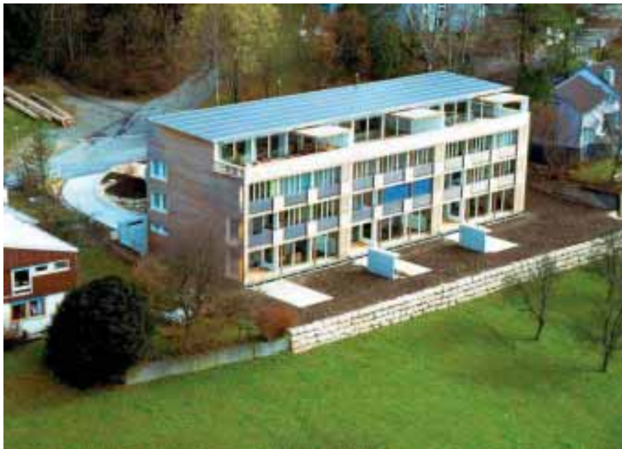
Fig. 9: 'Sunny Woods' PV installation with amorphous triple cells, (source: Kämpfen Architects)

In 2001, 11 new projects were begun in the PV P+D programme. The majority of these involve building integrated photovoltaics, particularly in roofs. Particular interest was raised by the construction of the Sunny Woods [52] (Fig. 9) passive solar apartment house in Zurich, which has a full-area roof integrated 16 kWp PV installation with amorphous cells. Detailed measurements on the project began in March 2002, and the first detailed results are expected at the end of 2002. It will be interesting to see what the reactions are to roof-integrated photovoltaics in the protected historic village center of Wettingen [83] (Fig.10) and to further developments in photovoltaic systems incorporated in green roofs. An example of the latter in the P+D programme is the Solgreen power station 1 in Zurich [54] (Fig. 11).