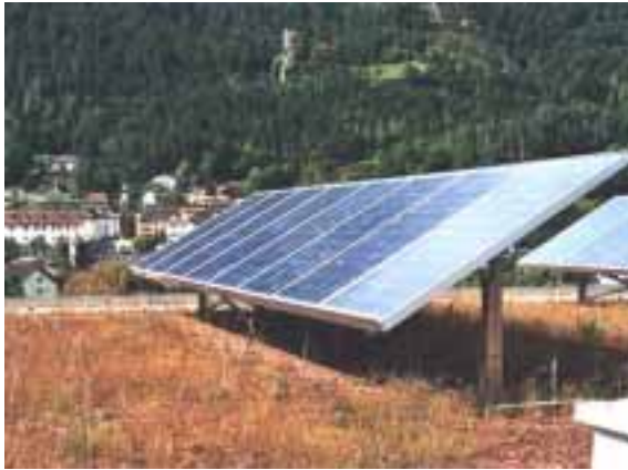
Fig. 16: Solgreen installation in Chur

installation at Felsenau [50], Fig. 18. Final data evaluation and project assessment are planned following completion of the measurement phase around mid-2002.