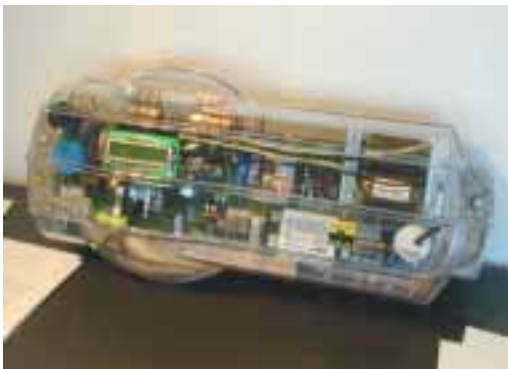
Fig. 6: In recent years, European sales of power inverters from Sputnik Engineering have boomed

Numerous Swiss products that had originated from P+D projects were able to maintain their market share both nationally and in other European countries. This applies especially to power inverters (Fig. 6), and to module integration and mounting systems. Where the two mounting systems SOLRIF and AluTec/AluVer are concerned, the clear indications of success the previous year were confirmed. By the end of 2001, SOLRIF profiles [82] (Fig. 7) for PV modules corresponding to a total rating of some 2 MWp had been delivered to customers in Europe, while for AluTec/AluVer [48] (Fig. 8), a volume corresponding to 3 MWp was exported. To judge by recent market developments, sales of the above two systems will remain at the same level or increase in the current year. These systems now rank among the highly successful P+D developments of recent years.