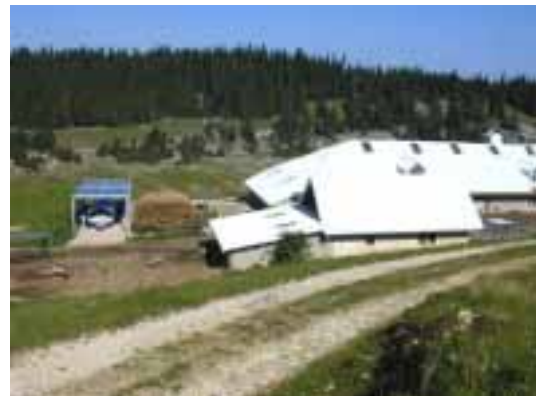
Fig. 19: Autonomous installation Alp Amburnex