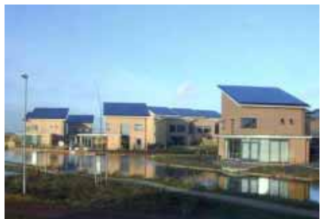
Fig 8: Roof integration using Alutec/AluVer in Holland