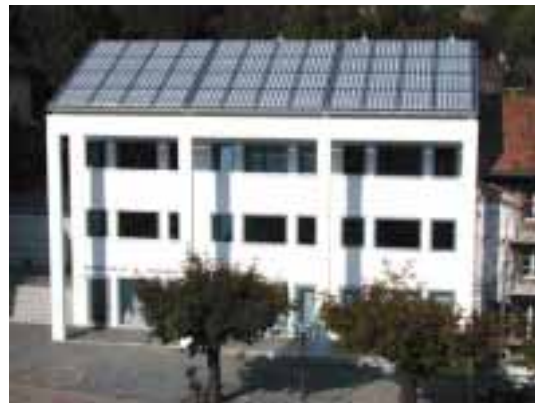
Fig. 23: PV roofs Altstadt Unterseen (source: NET Ltd.)