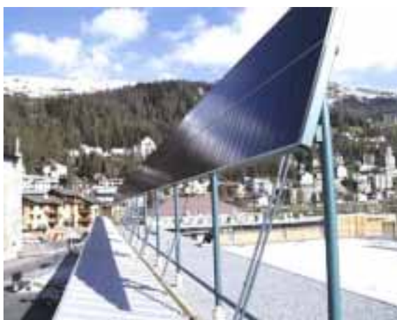
Fig. 12: Installation in St. Moritz using CIS modules