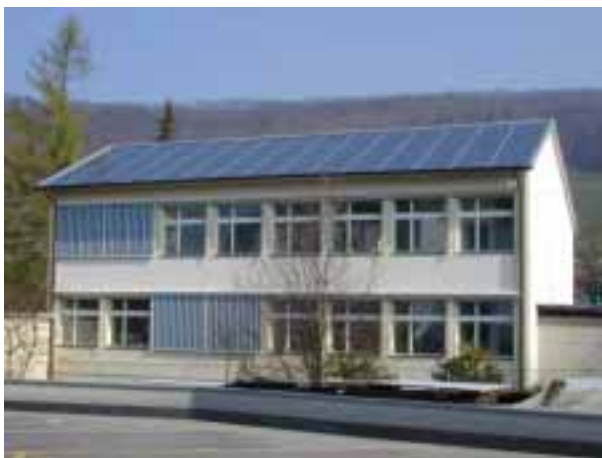
Fig. 10: Roof integration using SOLRIF in Wettingen