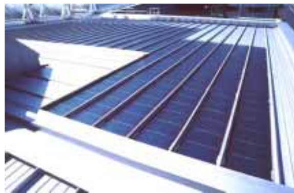
Fig. 15: PV Eurodach amorph, Flumroc

On the 10 kWp Solgreen installation in Chur [53], Fig. 16, plant growth is as desired. The green roof and the PV installation harmonize well, and no shading due to plants was observed. Experience gained in erecting the system was applied directly in further developing the Solgreen system.