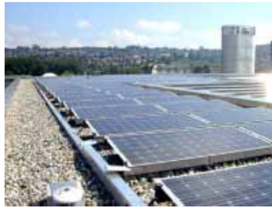
Fig. 21: Flat-roof installation IBM Zurich