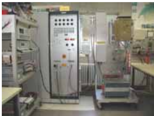
Fig. 5: 25 kW PV generator simulator (Burgdorf UAS), (source: Burgdorf UAS)

means, the development potential of each system and the need for action in future can be assessed.