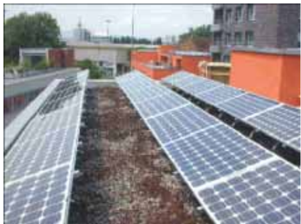
Fig. 11: Solgreen power station 1, Zurich