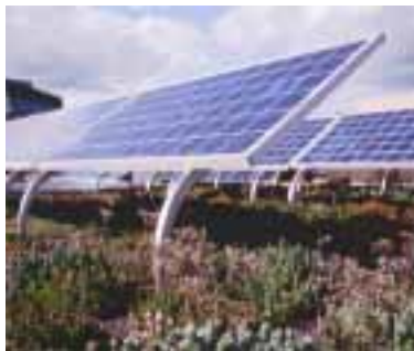
Fig. 1: „C-Shape installation“

As mentioned before, the system is subjected to improvements. Some earlier designs are on the market and work well. Main focus of the current activities are the cost reductions while keeping the high quality level. Installations done in Zurich and Basel will be monitored over a period of five years. This allows the detailed analysis of the changes over the time and the