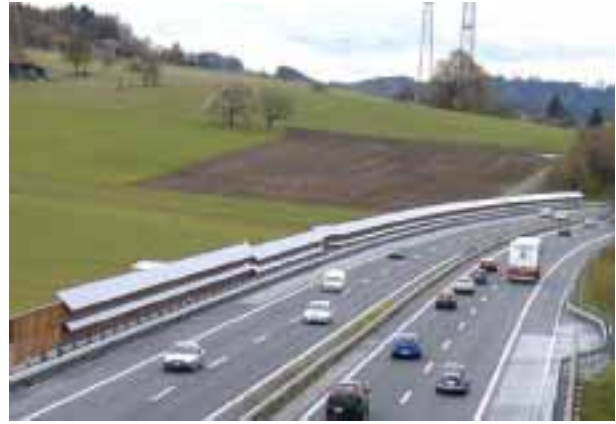
Fig. 17: Noise barrier A1 Safenwil